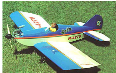
Similar to Slo Poke pictured